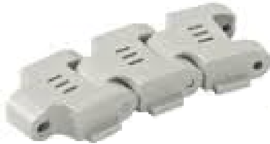
Plate Materials: POM-LF Pin Material: 304 Stainless Steel